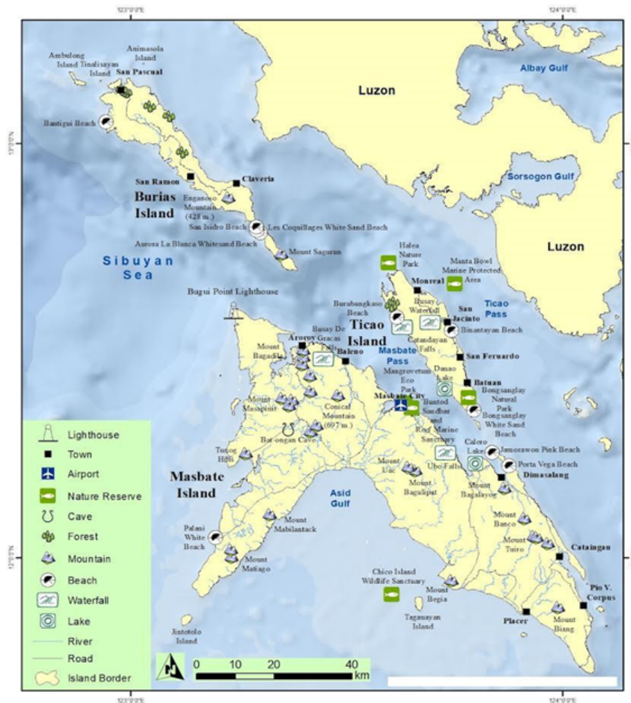
Figure 3. Tourism Map of the Masbate Province

While most of the villages and towns on the island of Burias and Ticao are located on the coast, the Masbate island has the opposite situation because more than 70% of the rural settlements are located inland, away from the sea coast. In terms of tourism and maritime transport activities, Aroroy, Cataingan, Pio V. Corpuz, Placer, Esperanza, Cawayan, Mandaon, Uson, Milargos, Pulanduta, Mobo, Balud and Baleno are the most important and busiest town settlements on the island of Masbate (Chirikov et. al., 2008). The Masbate City, the largest settlement and only city on the island of Masbate, is also the capital of the Masbate province. The Masbate City is the most important and busiest transportation, commerce, culture, education and tourism center of both the island and the entire province. The “Masbate Airport” situated within the boundaries of the Masbate City, is the province's most strategic transportation hub in terms of transportation links between the Philippine islands and international tourism.