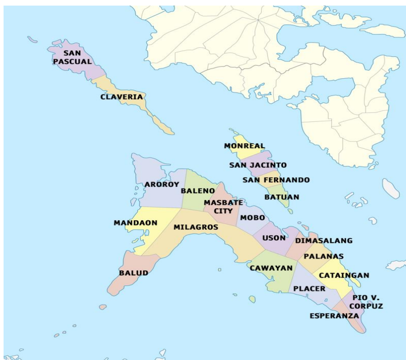
Figure 2. Administrative Map of the Masbate Province

● To paint a multidimensional tourism portrait of the Masbate Province and make a scientific presentation of the island from the perspective of tourism geography.