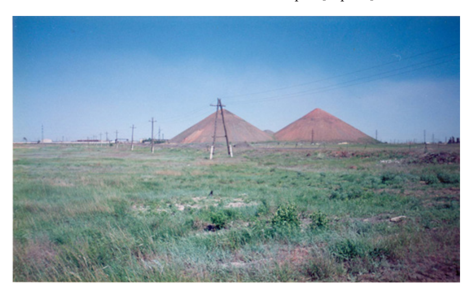
Figure 2. Heaps of the Karaganda coal basin.

Geocomplexes of Central Kazakhstan belong to the arid system and are developing under the conditions of manifestation of natural and technogenic processes. According to the peculiarities of geological and geomorphological differentiation of the territory, depending on local physiographic conditions and processes, landscapes are distinguished relative to the lowered accumulative plains, elevated denudation plains, small hills and island lowlands. Among the landscapes, relatively lowered accumulative plains, steppe and dry-steppe prevail. In tectonic terms, they are confined to the Karaganda, Maykyubinsky and Tengiz depressions. Landscapes of relatively elevated denudation plains formed on the effusive sedimentary rocks of the Paleozoic and are dry-steppe and semi-desert geosystems. They are the dominant landscapes of the Kazakh shield. At a higher hypsometric level, small-hilly landscapes of forest-steppe, steppe and semi-desert geosystems on metamorphic, effusive-sedimentary rocks of Precambrian and Paleozoic are developed [1, p. 27].